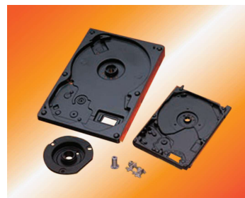
Surface Treated Parts

Equipment is installed for surface treatment such as electro-deposition painting surface treatment is conducted for HDD base plate and components, and motor components such as diecast parts produced at the Rojana facility and pressed parts for MinebeaMitsumi products manufactured at the Bang Pa-in Plant.